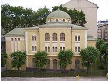
Turku, Finland Synagogue